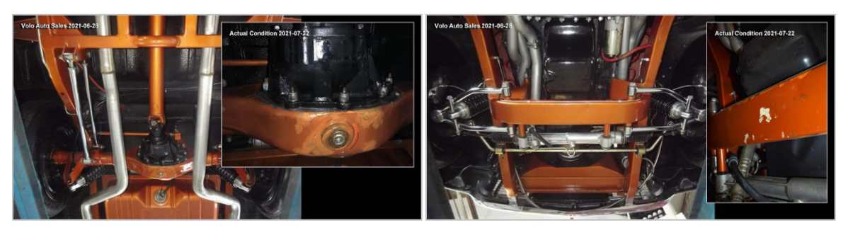
▲ Comparison Images – Advertised vs What Was Received