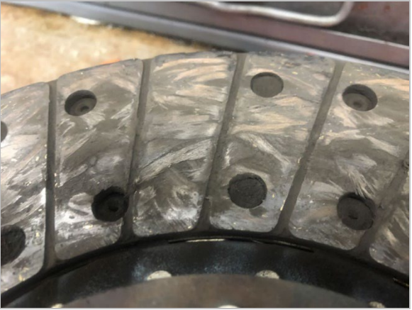
▲ Flywheel and Clutch Damage