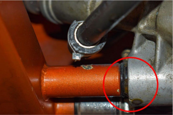
▲ Fluid Leaking from Rack and Pinion