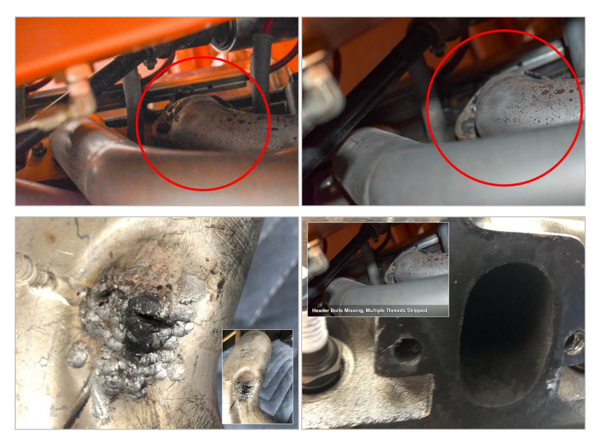
▲ Header Damage – Exhaust Leaks