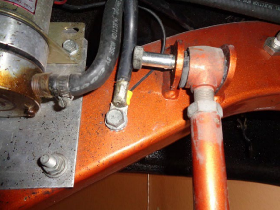
▲ Fuel Pump Leaking – Control Arm Bushing Damage