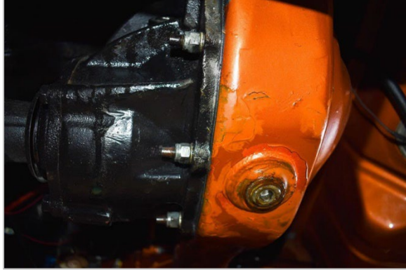
▲ Fluid Leaking from Third Member (Rear End)