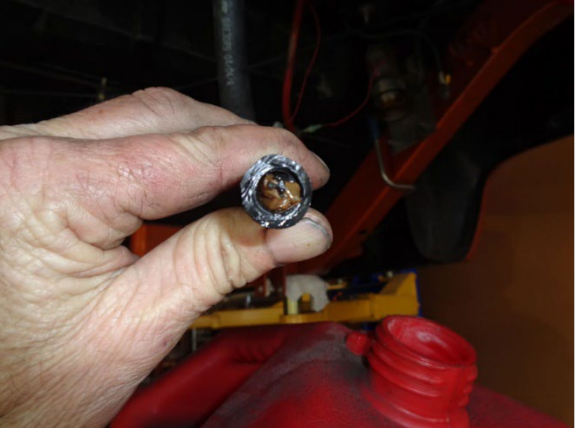
▲ All Fuel Lines Gummed