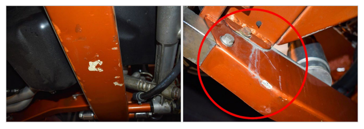
▲ Frame Damage NOT Shown or Seen in VAS Images