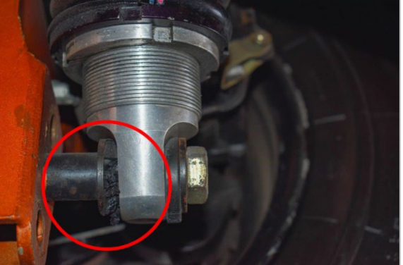
▲ ALL Coil Over Suspension Spacers and Bushings Damaged