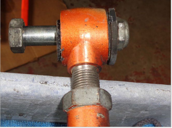
▲ All Control Arm Spacers and Bushings Damaged