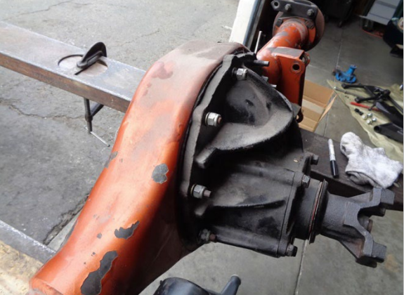
▲ Disassembled Rear End – Claimed New in Video