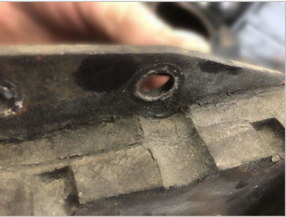
▲ Broken Motor Mounts