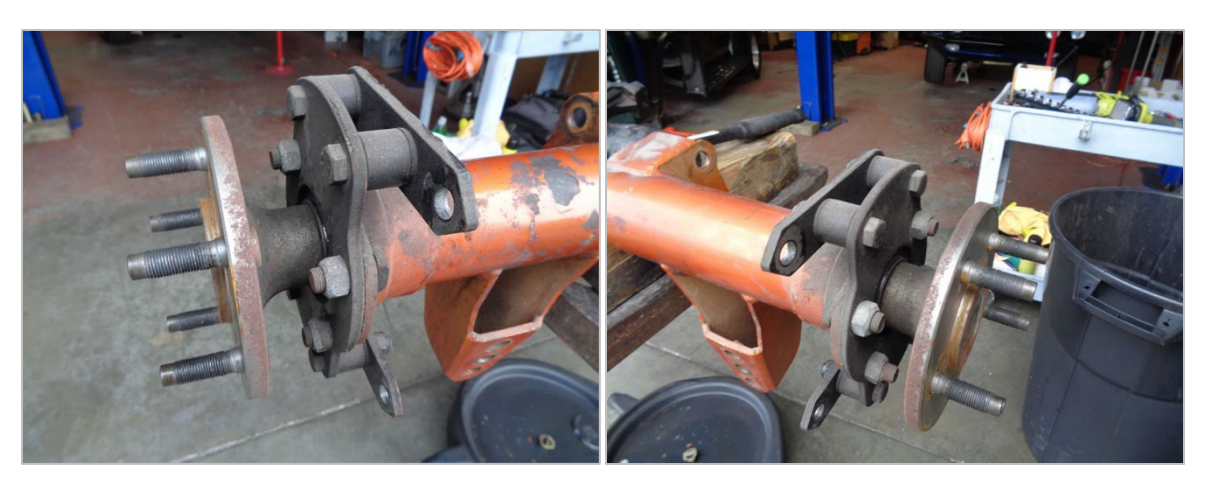
▲ Disassembled Rear End Axles